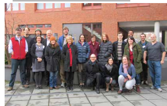
sChange working group