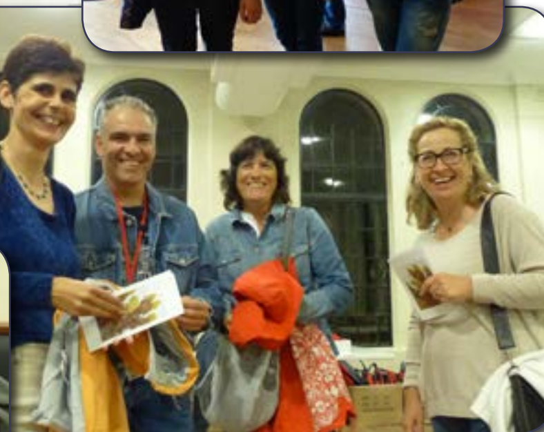
IAVS 2014 Pre-Conference Mixer - Submitted by Paweł Waryszak via IAVS Facebook Album