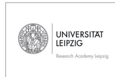
Research Academy Leipzig (ral) at Leipzig University

In addition, yDiv collaborates with the following graduate schools and research training groups locally: