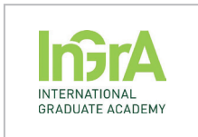
International Graduate Academy (InGrA) at the Martin Luther University Halle-Wittenberg

yDiv has been established under the umbrella of the graduate academies of the iDiv consortium: